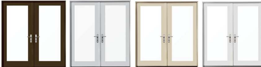
Bronze Anodized Silver Costa Latte White

We offer 4 Standard Paint Finishes... But We Can Also Offer Any Custom Color Under The Sun.